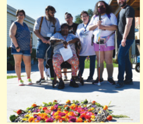
▲ Expressive Arts and Gardening use items from the garden to create a Mandala on campus.