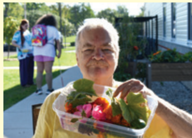
▲ Expressive Arts and Gardening use items from the garden to create a Mandala on campus.