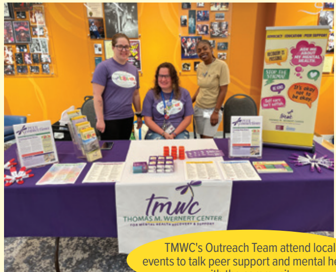
TMWC's Outreach Team attend local events to talk peer support and mental health with the community.