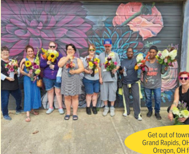
Get out of town! TMWC tripped to Grand Rapids, OH to pick flowers and Oregon, OH for a sweet treat!