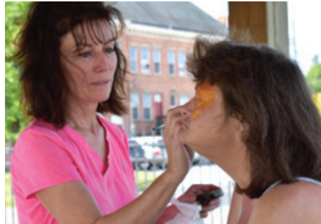
Photos from Recovery is Beautiful 2022

National Recovery Month has been celebrated in September nationwide since 1989. This initiative was started by the Substance Abuse and Mental Health Services Administration (SAMHSA) to increase awareness about mental illness