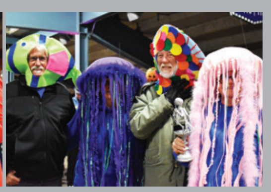
Congratulations to the winners of the costume contest! The categories were Funniest, Scariest, Most Unique, and Best Group!